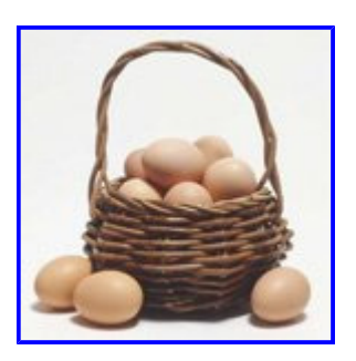
What's that got to do with the price of eggs?