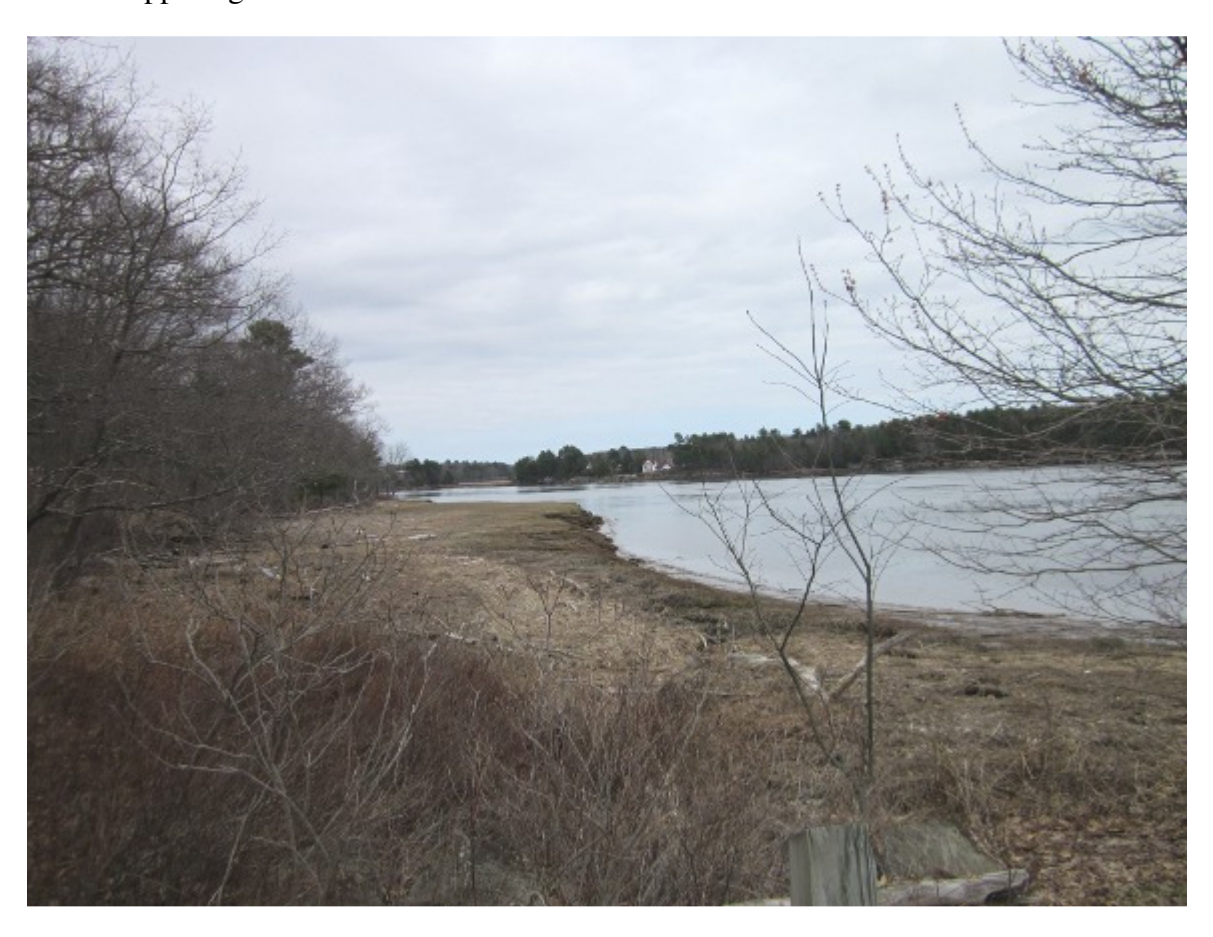
A view of Fiddler's Reach from the public landing at Morse Cove, a popular boat launch in the dump area.

"We recovered the Kennebec to the point where it is one of the most important shellfish operations in the state, and a large population in the area makes their living off clamming and lobstering," Hinchman added. "We've worked too hard and spent too much money cleaning up our rivers to allow this to happen again."