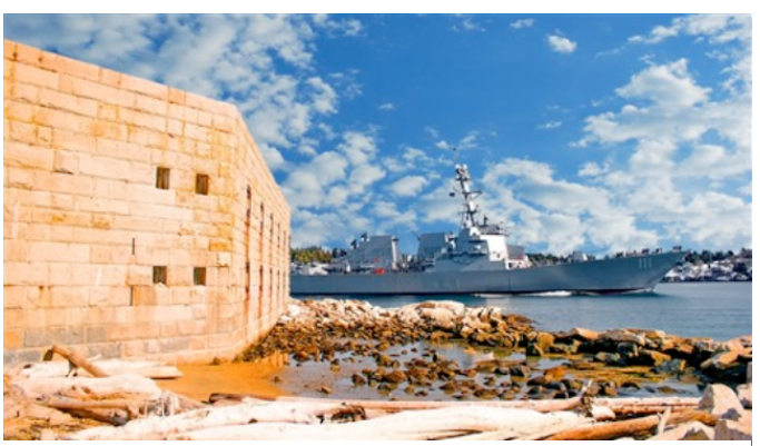
Figure 1: The U.S.S. Spruance seen leaving the mouth of the Kennebec River at Fort Popham on Feb. 18, 2011

In this case, however, there need be no delay. The Spruance can clearly exit the Kennebec River safely without dredging; it did so to conduct sea trials just last month as shown by the photograph in Figure 1. Thus, there is simply no need for emergency out-of-season dredging and all of the adverse impacts it would cause. The No Action Alternative is clearly practicable, less environmentally damaging, and cost effective – in fact it would save taxpayers