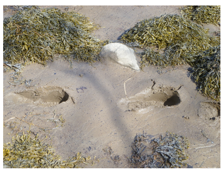
Figure 3: A thick layer of mud and muck still coats the western shore of the Kennebec Narrows approximately 17 months after being deposited from the dumping of dredge spoils in 2009

The Kennebec Narrows disposal site north of Bluff Head is a rocky deep, narrow (300 yards) channel with strong currents, eddies and upwelling. It is a critical and very biologically rich area: all the aquatic life that rides the currents up and down the Kennebec transits these narrows. Since it is a fertile fishing ground, it attracts diving ducks, birds, birds of prey and seals. Impacts to this rich aquatic environment have not been studied; nor are there any analyses of impacts to this river segment in the draft EA or Public Notice document.