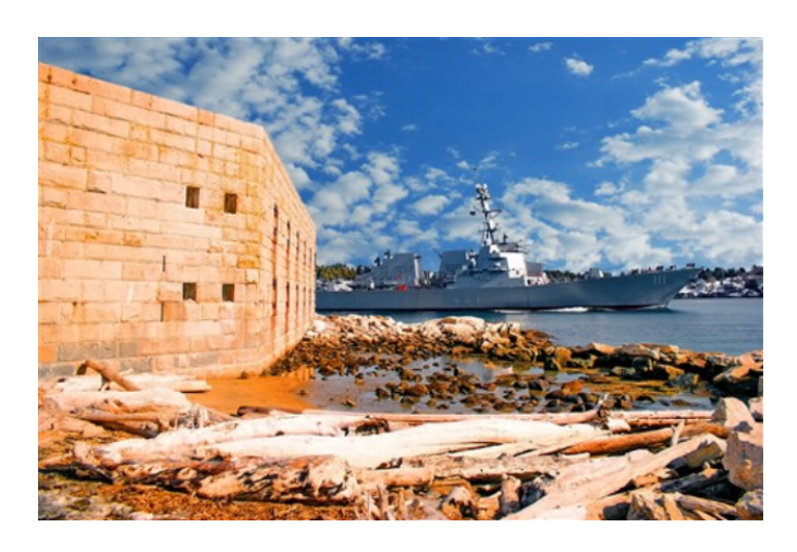
Figure 1: The U.S.S. Spruance seen leaving the mouth of the Kennebec River at Fort Popham in February 2011

Thus, the evidence currently fails to shows the need for out-of-season dredging in either location. This is particularly true for the North Sugarloaf Island reach, which is only partially shoaled and is open for ship passage at MLLW depths of 27'. Neither the BIW nor the Army Corps' memorandums and emails explaining the need for this project state that August dredging is necessary in the North Sugarloaf Island reach to allow the Spruance to safely transit the river.<sup>11</sup> Barring new evidence to the contrary, no action at North Sugarloaf Island is clearly practicable and less environmentally damaging.