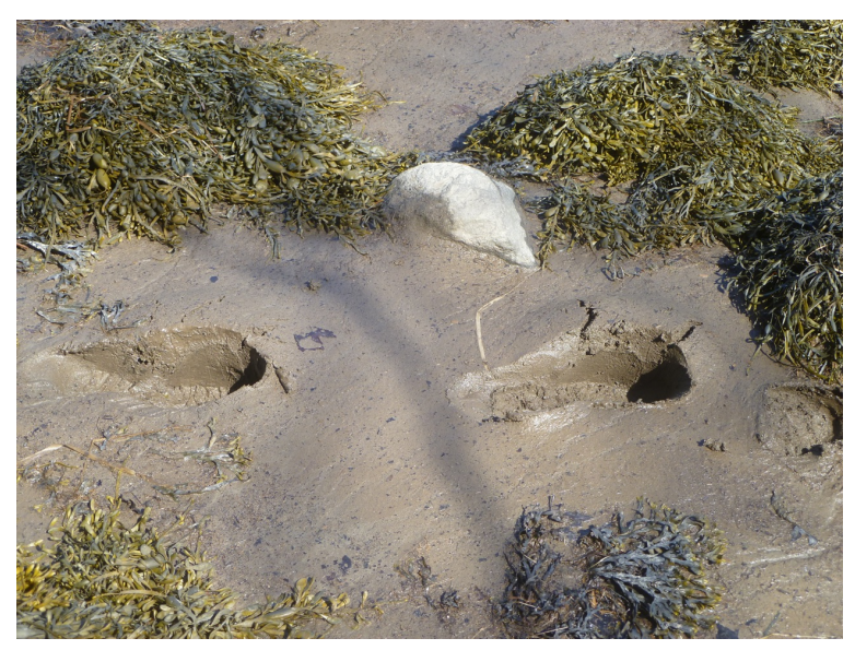
Figure 2: A thick layer of sand still coats the western shore of the Kennebec Narrows approximately 17 months after being deposited from the dumping of dredge spoils in 2009

Sustained burial of the Kennebec Narrows' normally rocky shoreline under a thick layer of sand and mud fundamentally alters normal conditions and detrimentally affects the resident biological community by filling interstices and smothering habitat. This is a clear violation of class SB habitat and aquatic life standards. Although Appellants raised this concern during the public comment period, the Department made no effort whatsoever to review this concern or even respond to the Appellants concerns. See Order at 6-7.