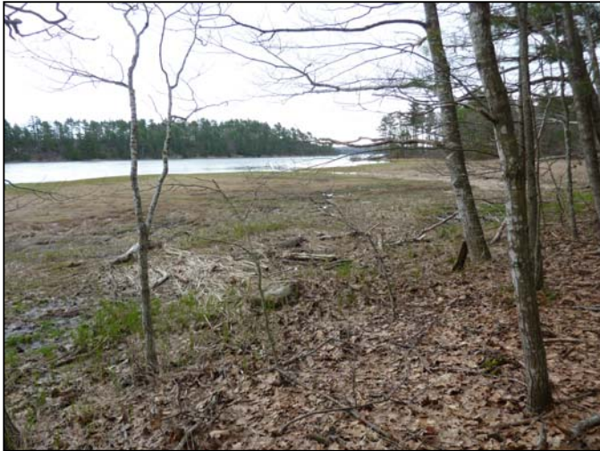
View down river from the Greenleaf Preserve in Fiddler's Reach. This preserve would be the most significantly affected by the dredging operation.

Moreover, the dredging and disposal proposed will be a full time, noisy and industrial process. This will destroy the serenity and beauty that visitors to Phippsburg Land Trust preserves seek. The dredging and disposal will drive wildlife from the river and the adjoining shores, potentially damage wetland plants and animals, and disrupt the enjoyment of visitors to Phippsburg Land Trust. It should not be approved for the August time frame, when it will be maximally destructive.