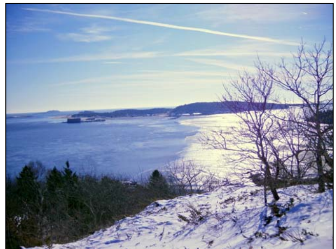
View of Fort Popham and the Atkins Bay shellfish flats from the summit of Cox's Head. These flats are among the most productive shellfish flats in Phippsburg.

The proposed timing for the dredging will cause immense hardship in Phippsburg. The economic impact on those who work in the recreational fishing and tourism economy in Phippsburg will be significant. Lobstermen who routinely fish off Jackknife Ledge will be displaced at minimum; traps, equipment and the lobsters themselves may also be damaged or destroyed. Most significantly, the prospect of a month or longer closure of the Kennebec River shellfish flats will be a devastating economic loss for the 40 Phippsburg families that depend on income derived from a commercial shellfish harvesting license. The vast majority of our shellfish are harvested in Kennebec River flats, and the majority of the