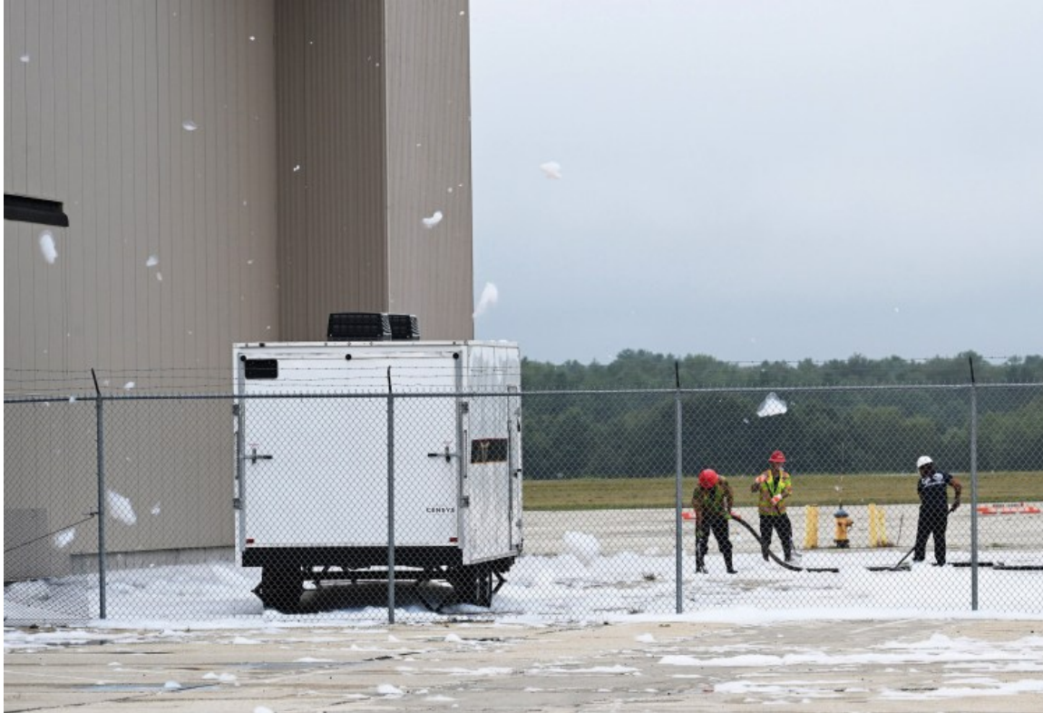
Workers clean up a chemical spill at Brunswick Executive Airport on Monday.

The vast majority of the highest-profile PFAS contamination cases around the country have occurred on or near manufacturing facilities and military bases with airfields. Firefighting foam is the primary culprit in most military PFAS contamination cases.